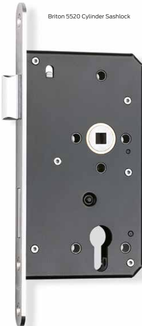
Briton 5520 Cylinder Sashlock

A comprehensive range of mortice lockcases for use with Euro profile cylinders.