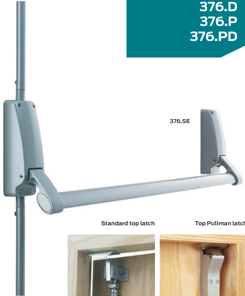
Standard top latch