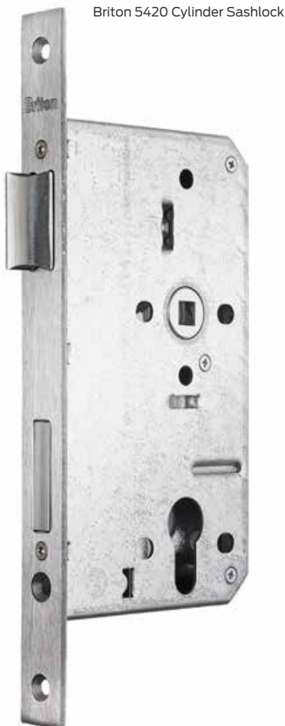
Briton 5420 Cylinder Sashlock

A comprehensive range of mortice lockcases for use with Euro profile cylinders.