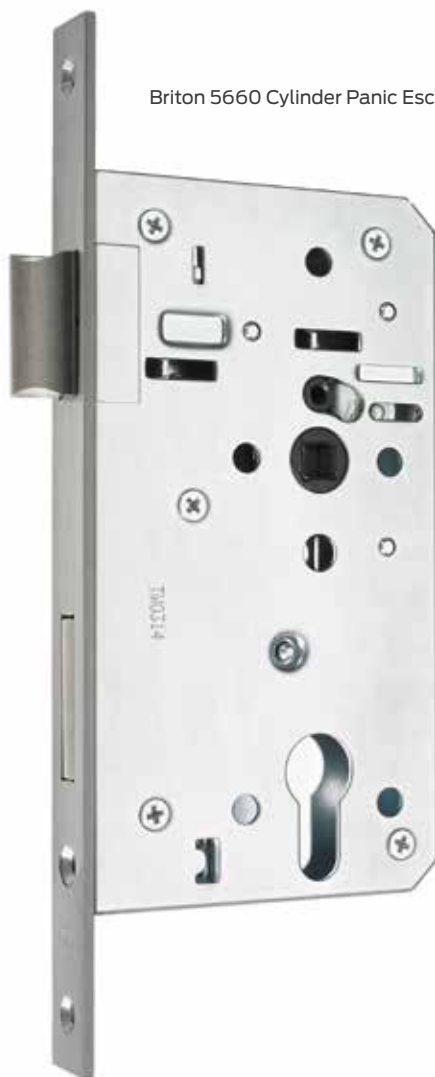
Briton 5660 Cylinder Panic Escape Sashlock

A series of mortice lockcases for Euro profile cylinders. Multiple function options - see table.