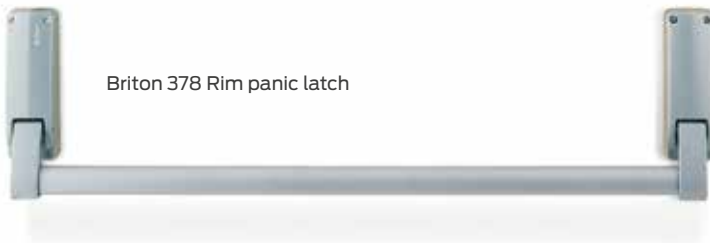
Briton 378 Rim panic latch