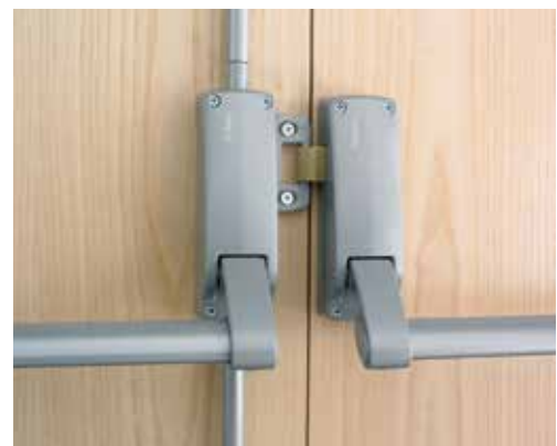
Double door variant Briton 377 complete with strike plate