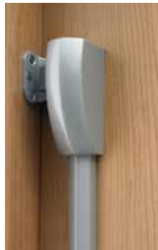
Upper Side Pullman