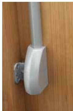
Lower Side Pullman