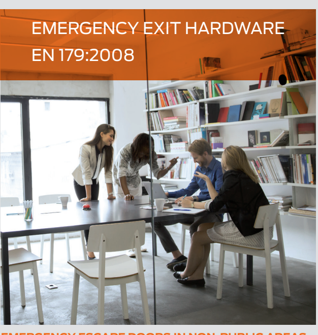
EMERGENCY ESCAPE DOORS IN NON-PUBLIC AREAS

Applies where the exit door is used by trained personnel who are familiar with the emergency exit and its hardware and therefore a panic situation is unlikely to occur.